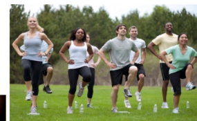
Fitness Boot Camps